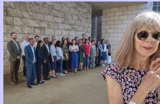
The Getty Scholars at the Getty Center