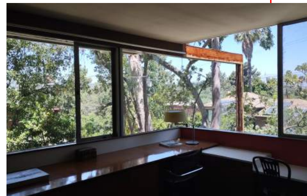
Corner window with spider-leg, Reunion House primary bedroom