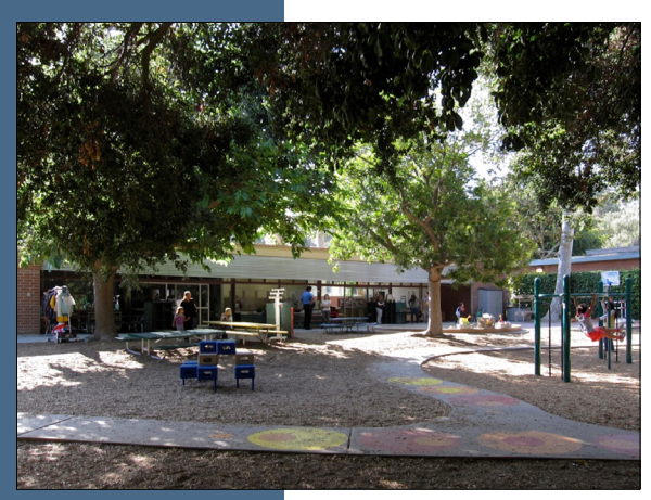
University Elementary School, 1957