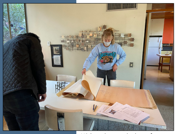
USC students with plans of Reunion House.