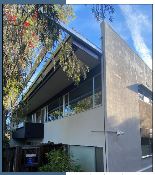
Restored rear fascia, planter box and updated paint colors