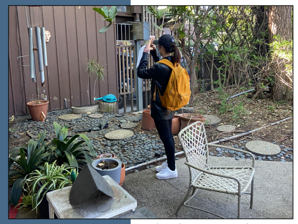
Student documents conditions at Reunion House in February 2022.