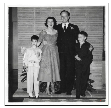
Wedding on the Hearth, 1952